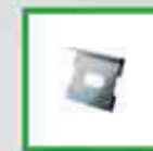
DU.9990 9623010 Covering plate for DU.V90.