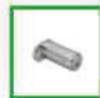
E.LOCKSE 9765002 Extended cylinder for E.LOCK electric lock. It allows to unlock gates up to 55mm-thick from the outside.