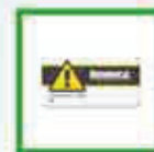
ID.TA 9846019 Warning board.