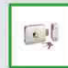
DU.V90 9765030 12 Vac/dc horizontal electric lock, supplied with counterplate. Permits internal/external release.