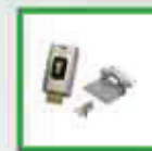
DU.V96 9765035 12 Vac/dc vertical electric lock, supplied with counterplate. Permits internal/external release.