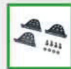
B.SR 9819310 Multiposition brackets for one operator BILL50M/L.