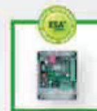
ESA BASIC 9176108 System that reduces the electrical energy consumption.