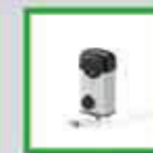
E.LOCK 9765001 230 Vac vertical electric lock, supplied with counterplate.